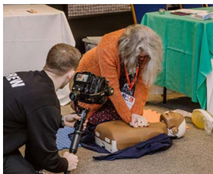
PRODUCT DEMOS & OFFERS