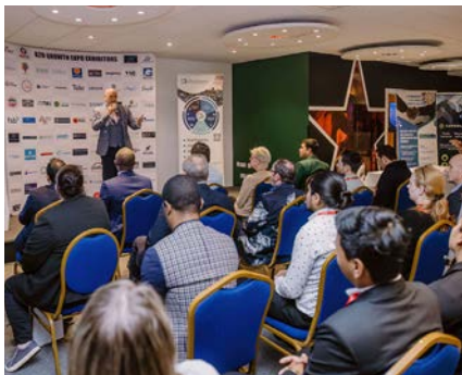
WORKSHOPS & SEMINARS

If your business is attracting new customers from advertising and word of mouth, it can be very tempting to write trade shows and business expos off as something that you don't need to do to attract new customers.